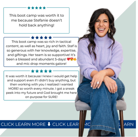
Creative (made by me)